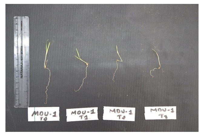
Fig. 1: Seedling growth in different concentration of NaCl. MDU1

*Significant at 5% level; **Significant at 1% level.